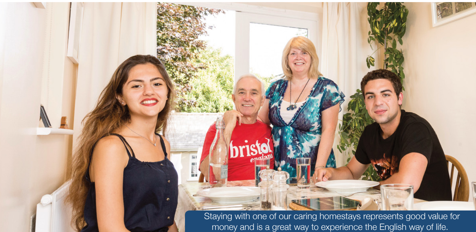
Staying with one of our caring homestays represents good value for money and is a great way to experience the English way of life.